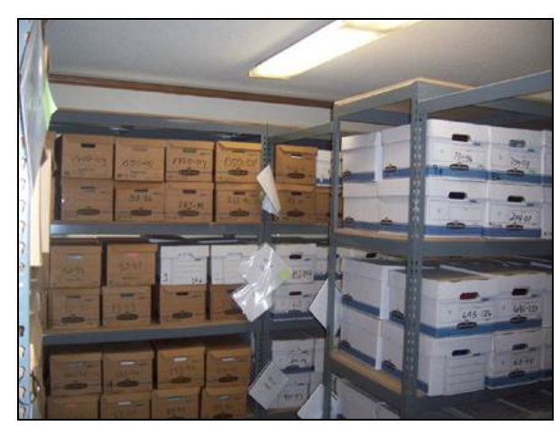
Storage Room on Main Floor